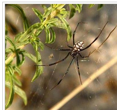
Male L. tredecimguttatus