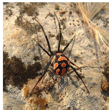
Female L. tredecimguttatus