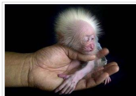
An infant stump-tailed macaque