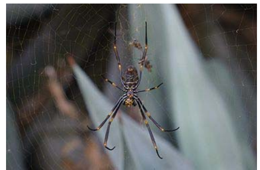
Female Nephila plumipes eating a ladybird, with male in attendance