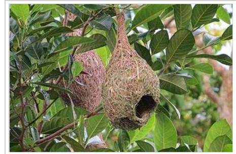
Weaver nest in Malaysia