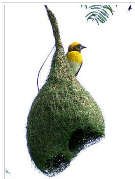
Weaver in Northern India