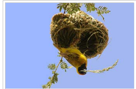
Southern masked weaver building his nest. Etosha National Park, Namibia.