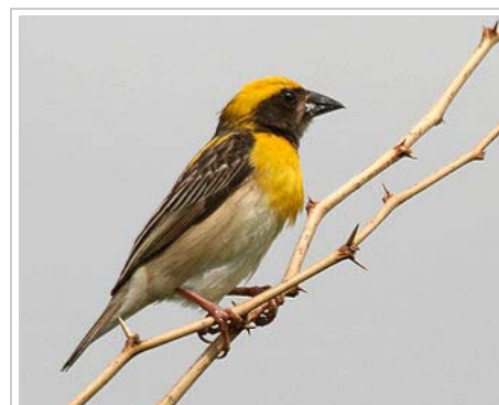
Male baya weaver in Hyderabad, India