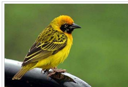
Male Speke's weaver in the Serengeti, Tanzania