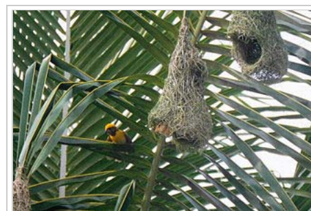
Weavers and nests in western India