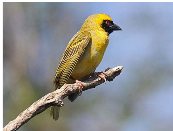
Male southern masked weaver ( Ploceus velatus )