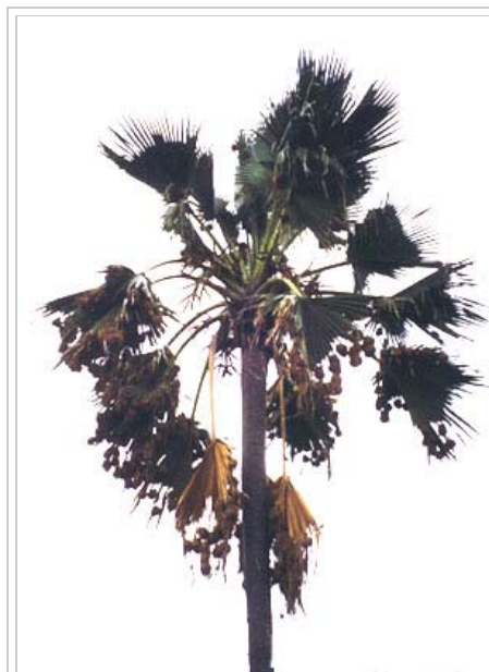
Village weaver colony in The Gambia. The nests are the spherical suspended objects.