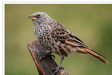
Rufous-tailed weaver in Ngorongoro Crater, Tanzania.