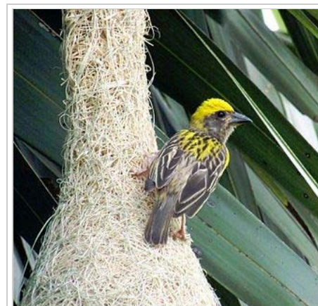
Baya weaver in Gobichettipalayam, India