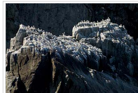
Black-legged kittiwake colony on Big Koniuji, Shumagin Islands

In contrast to the dappled chicks of other gull species, kittiwake chicks are downy and white since they are under relatively little threat of predation, as the nests are on extremely steep cliffs. Unlike other gull chicks which wander around as soon as they can walk, kittiwake chicks instinctively sit still in the nest to avoid falling off. [3] Juveniles take three years to reach maturity. When in winter plumage, both birds have a dark grey smudge behind the eye and a grey hind-neck collar. The sexes are visually indistinguishable.