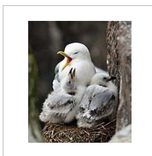
Farne Islands, England