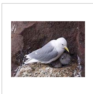
Kittiwake with chicks, Iceland