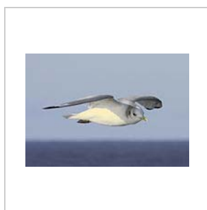
Kittiwake - winter Ireland