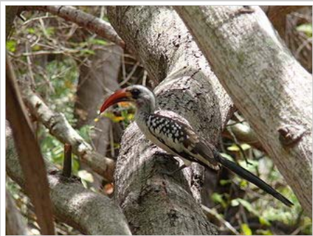
T. kemp is the only species with both dark eyes and blackish ocular skin

which is blocked off with a plaster of mud, droppings and fruit pulp. There is only one narrow aperture, just big enough for the male to transfer food to the mother and the chicks. When the chicks and the female are too big for the nest, the mother breaks out and rebuilds the wall. Then both parents feed the chicks.