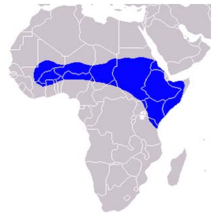
Distribution of Red-billed Hornbills