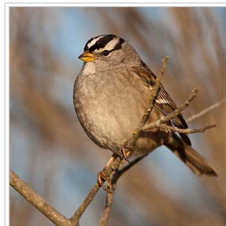
In California, United States