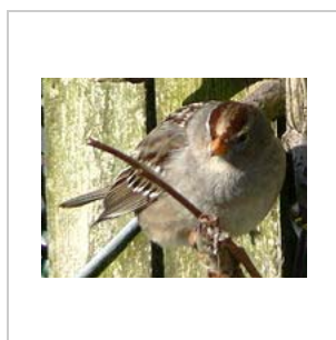
The juvenile (first winter) plumage is more muted than the adult