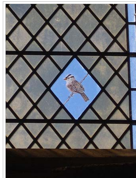
Depiction of a white-crowned sparrow in window in St Margaret's Church, Cley next the Sea, Norfolk.