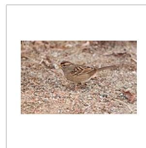
Female white-crowned sparrow hunting for food on the ground. Owl Canyon on the western shore of Bodega Harbor, California