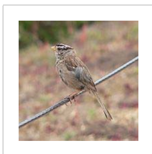
nuttalli subspecies specimen from Point Lobos State Reserve, California